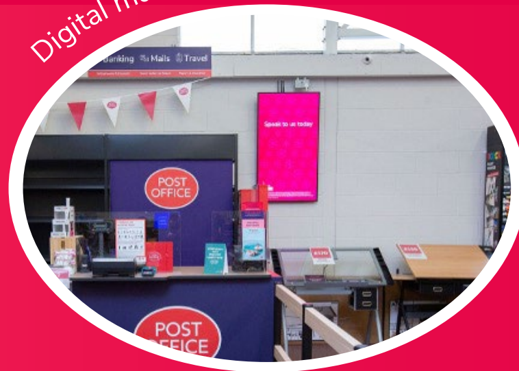
Digital marketing screens