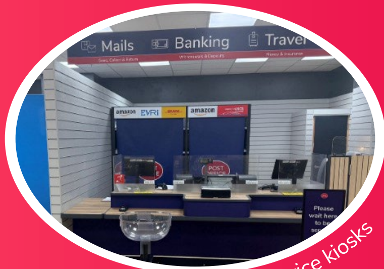
Upgraded self service kiosks